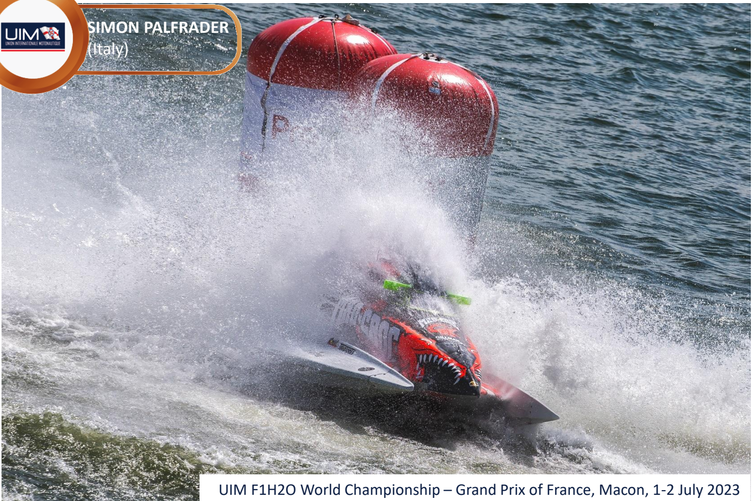
UIM F1H2O World Championship – Grand Prix of France, Macon, 1-2 July 2023