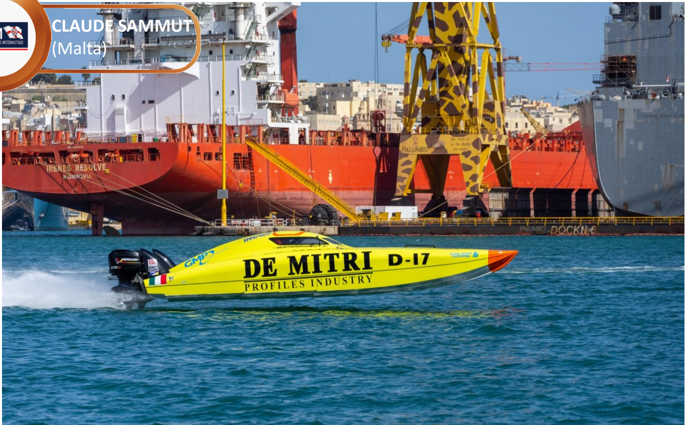
UIM World Championship – Offshore Class V2 – Sliema Promenade, Malta, 19-21 May 2023