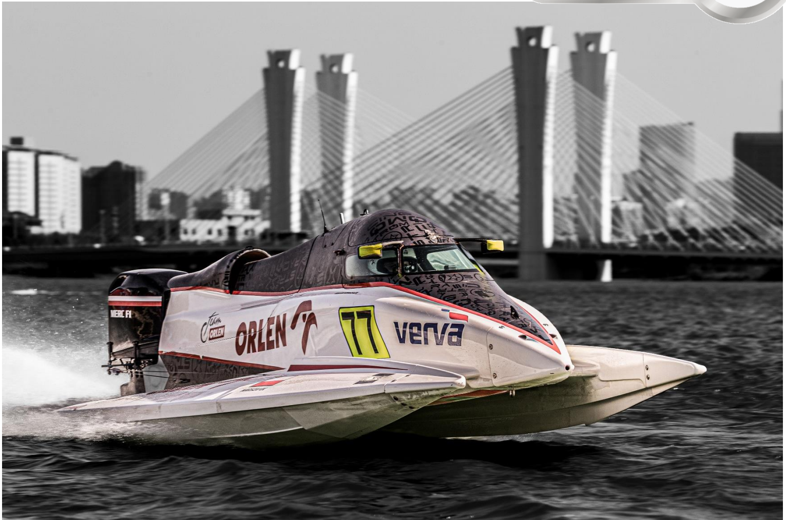
UIM F1H2O World Championship – Grand Prix of China, Zhengzhou, 29-30 April 2023