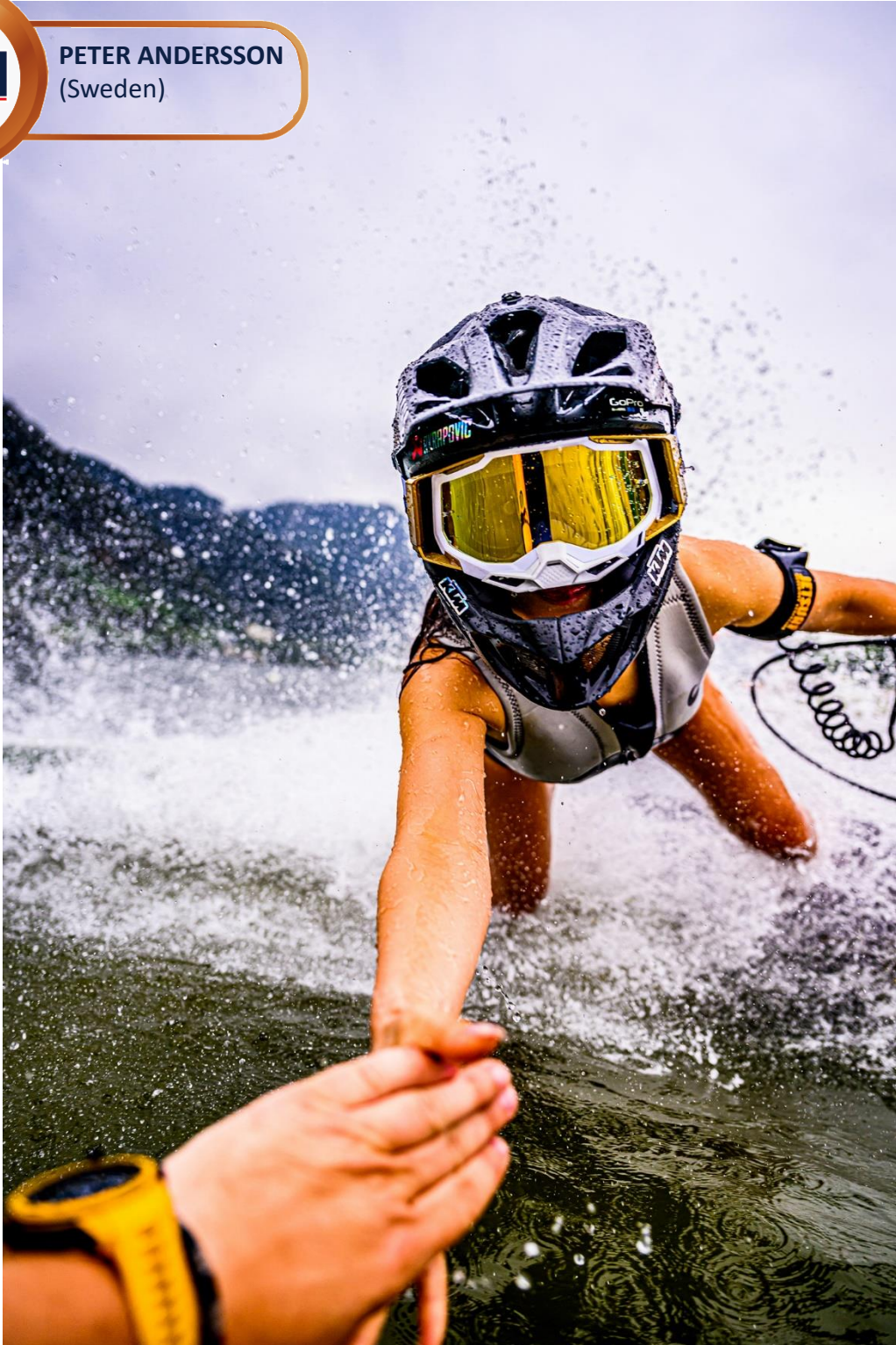
Motosurf Training, Open Class in Magok, South Korea, 26 August 2023