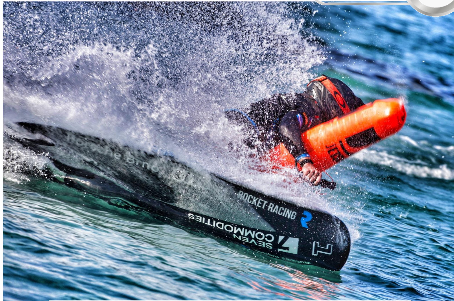
UIM MotoSurf World Championship – Grand Prix of Croatia, Zadar, 6-8 October 2023