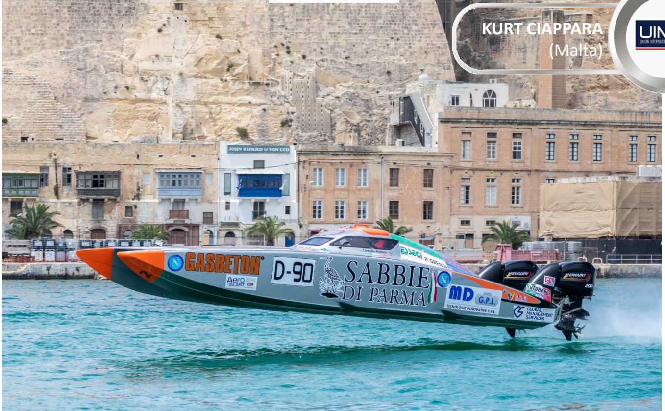
UIM World Championship – Offshore Class V2 – Sliema Promenade, Malta, 19-21 May 2023