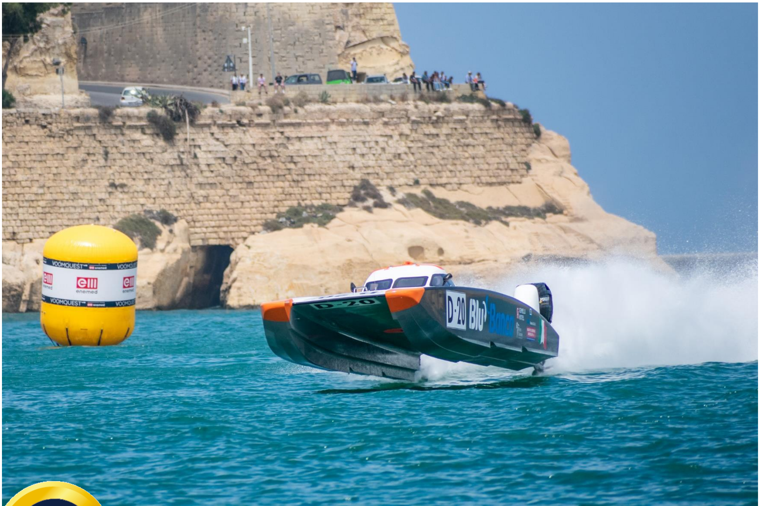
UIM World Championship – Offshore Class V2 – Sliema Promenade, Malta, 19-21 May 2023