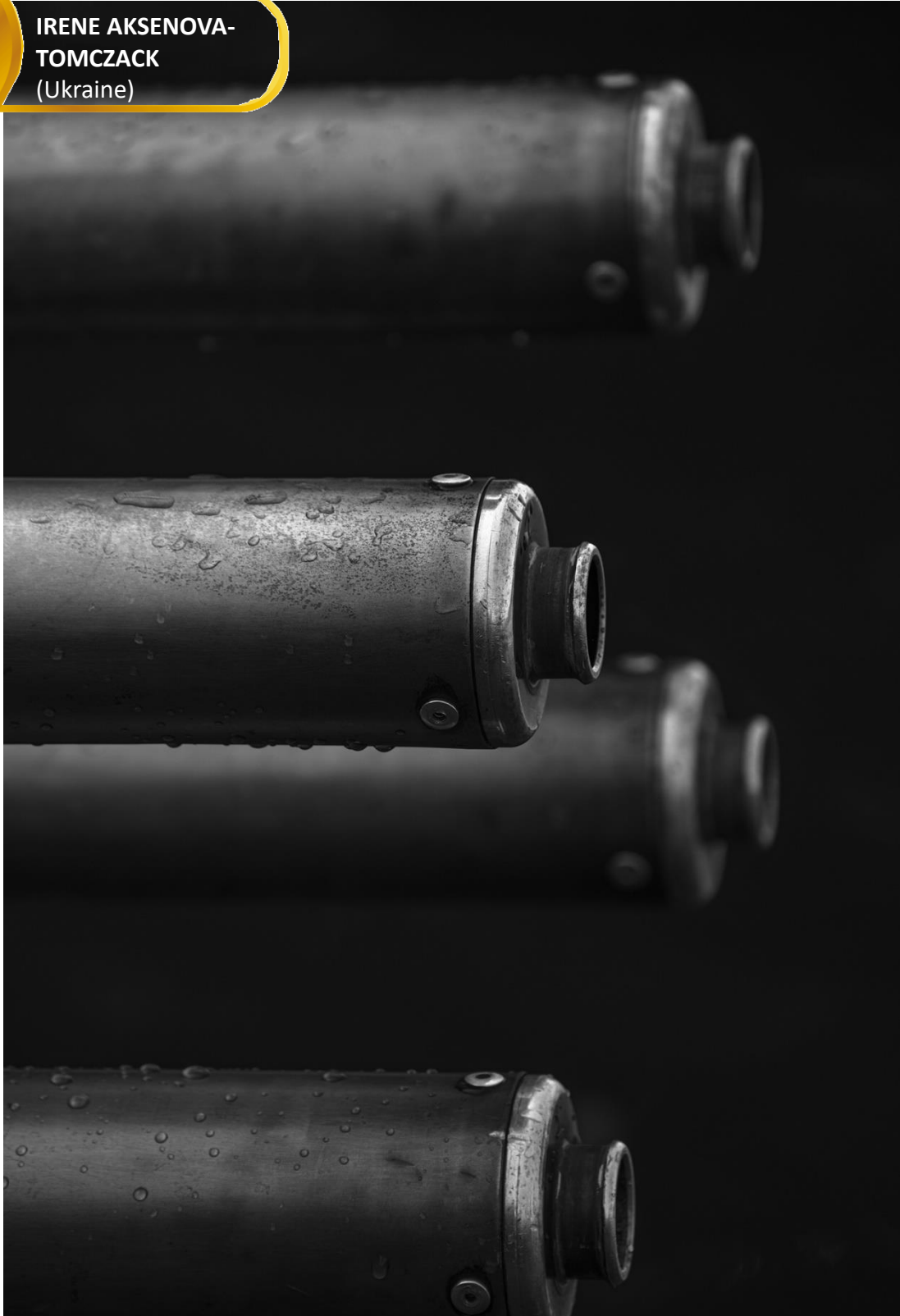
UIM European Championship – F500 – Trzcianka, Poland, 19-20 August 2023