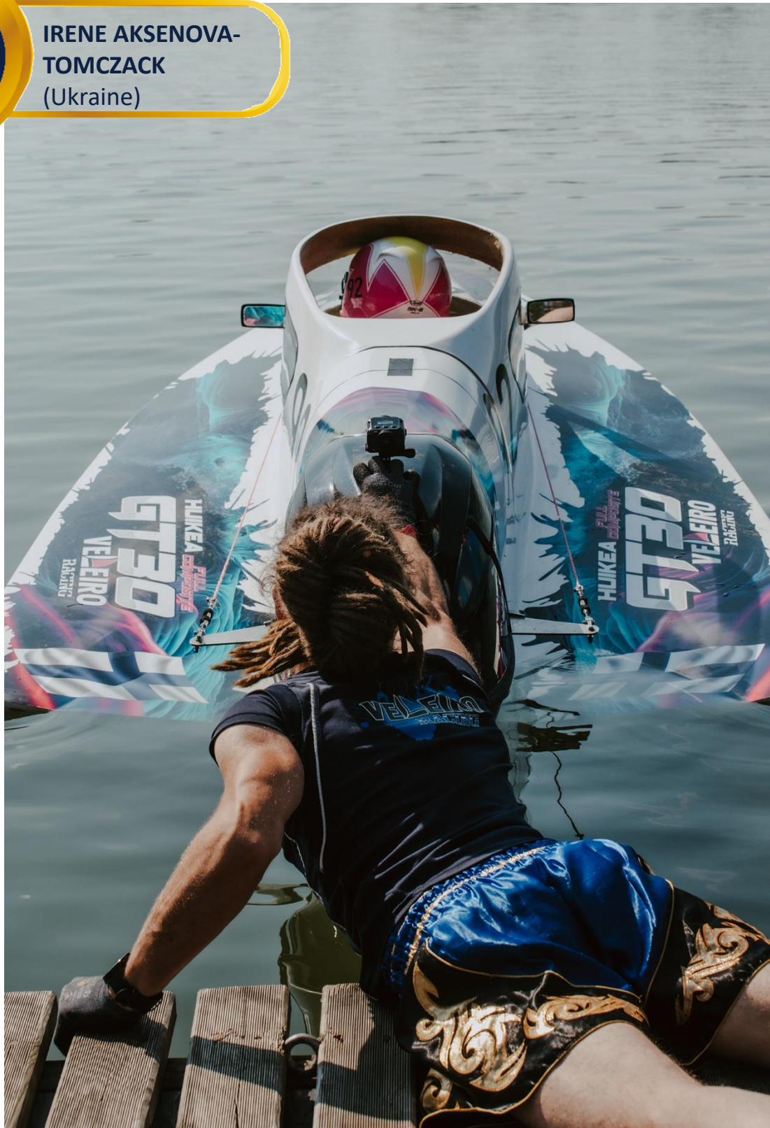
UIM World Championship – GT30 – Trzcianka, Poland, 19-20 August 2023