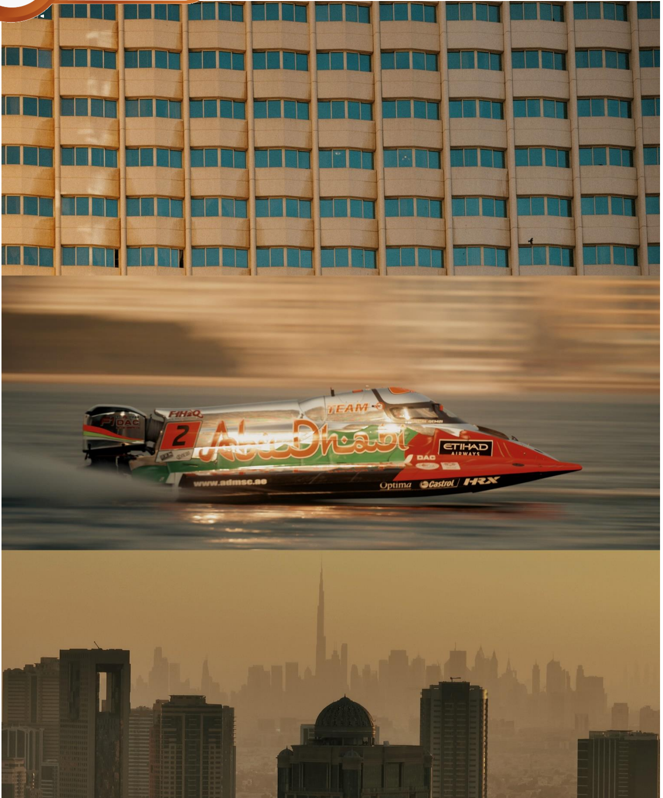
UIM F1H2O World Championship – Grand Prix of UAE, Sharjah, 8-10 December 2023