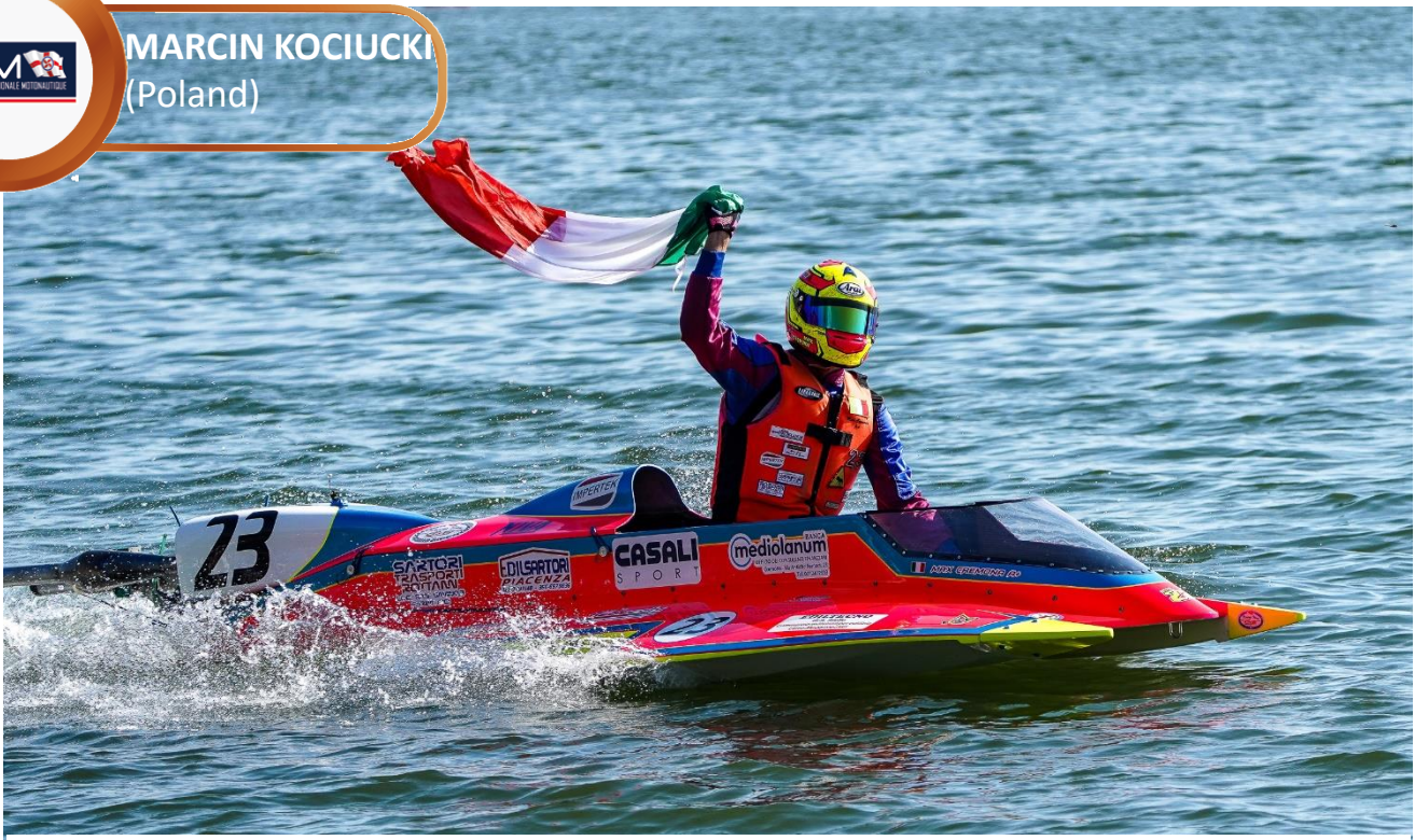
UIM World Championship – F250 – Bad Saarow, Germany, 15-16 September 2023