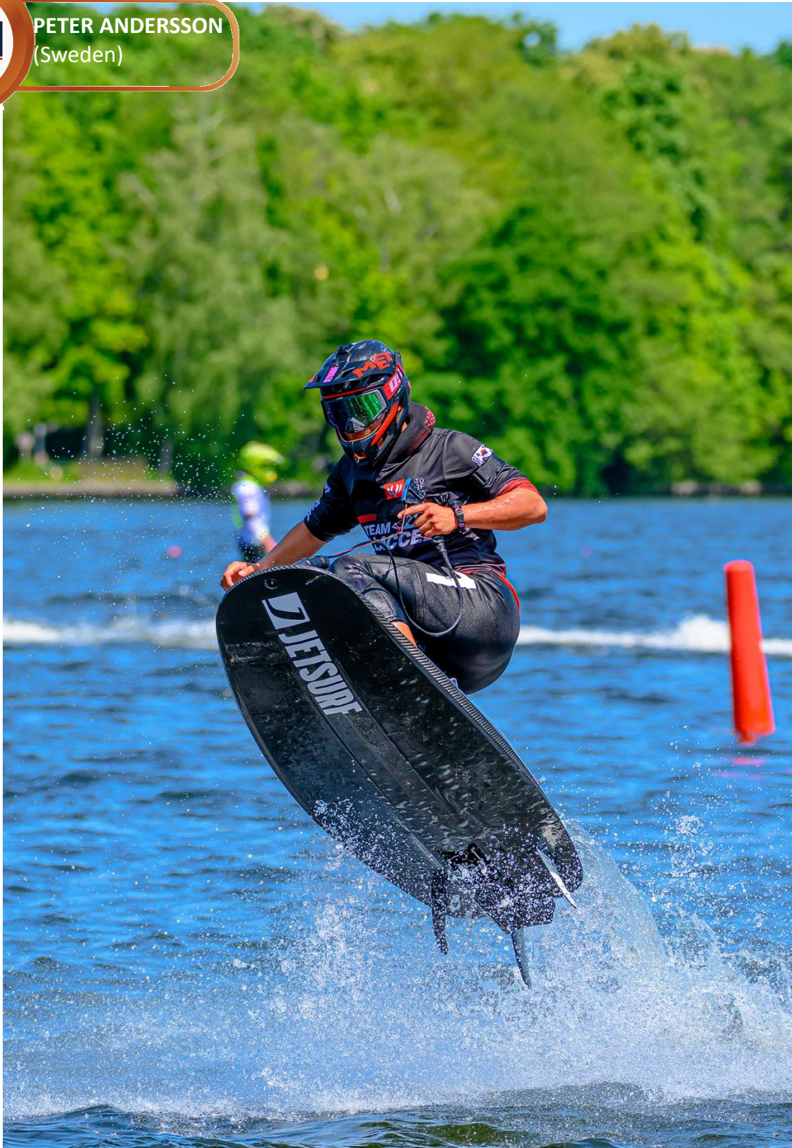
UIM MotoSurf World Championship Grand Prix of Germany, Berlin, 26-27 May 2023