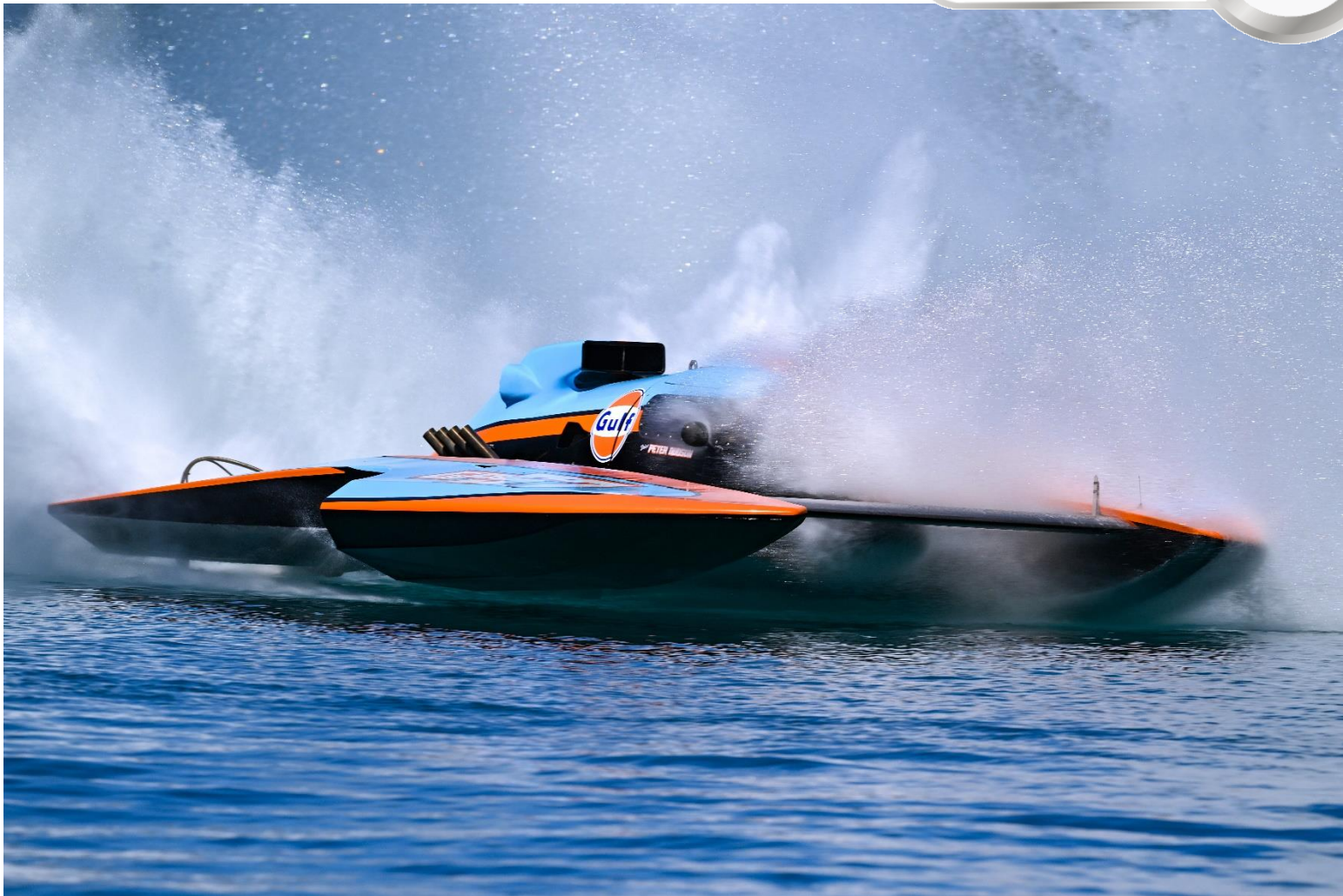
Hydro Thunder Series Event at Lake Ruataniwha, Twizel, New Zealand, 18 November 2023