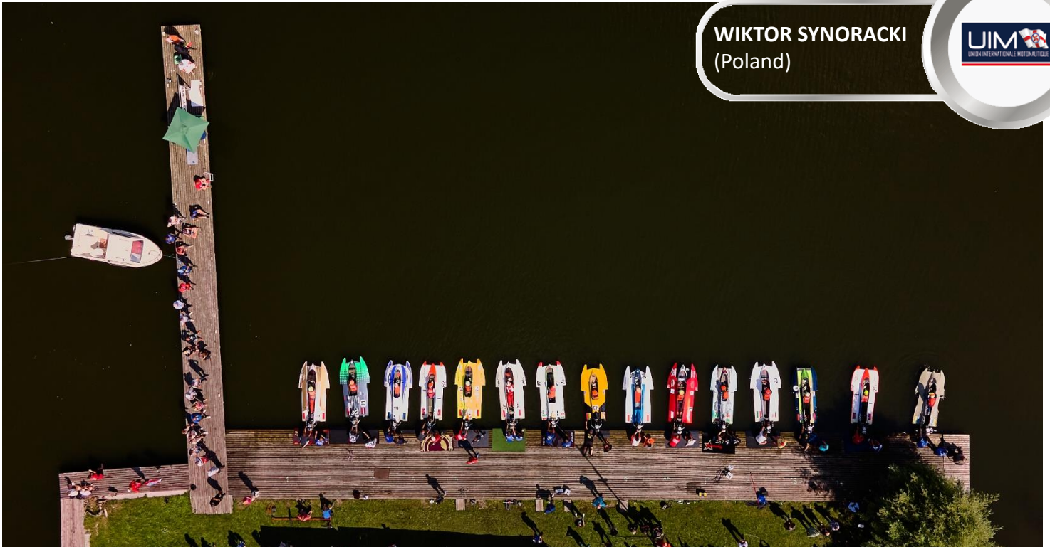
UIM European Championship – F250 – Chodzież, Poland – 24-25 June 2023